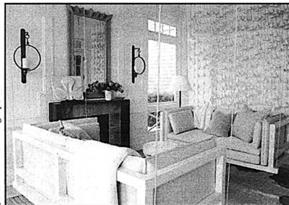
Brad Ford's screened porch

In KA Design Group's sumptuous contemporary Great Room, white, pink, brown and green furniture and art make the room pop. The mélange of color is encased in a wall wrapping of a dark, almost-black Venetian plaster, above traditional white molding. A tongue-in-cheek Vic Muniz art-from-chocolate syrup